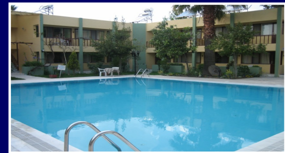
Enjoy our swimming pool