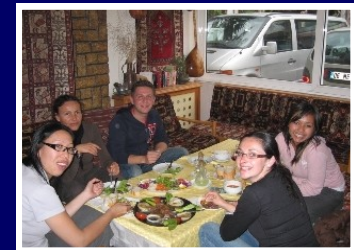
Relaxed family atmosphere